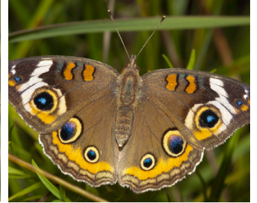
18 Common Buckeye Junonia coenia

NORTHERN PEARLY-EYE: no large eyespots. Eyespots on the underside edge of the wing surrounded by yellow. Tends to be more strongly patterned on underside. Somewhat scalloped hindwing. Savanna species. Host Plants: grasses (Poaceae).