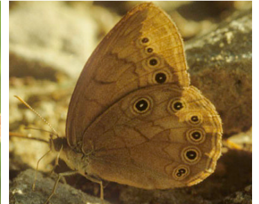
24 Eyed Brown Lethe eurydice

LITTLE WOOD SATYR: much smaller than the above species and quite variable. Eye spots on all wings. Found in woodlands. Host Plants: Grasses (Poaceae).