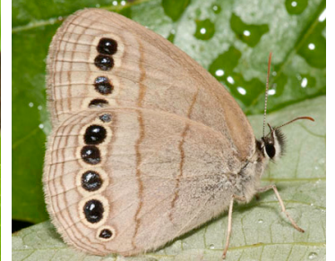
27 Little Wood Satyr Megisto cymela

COMMON WOOD NYMPH: two large eye spots on forewing. Small dots in a row on hindwing. Found in open habitats. Host plants: Grasses (Poaceae).