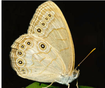
22 Eyed Brown Lethe eurydice

EYED BROWN: no large eye spots. Eyespots on the underside edge of the wing surrounded by yellow and then surrounded by individual rings of brown. Each spot looks like a donut. Rounded hindwing. Found in sunny open areas. Host Plants: Sedges ( Carex ).