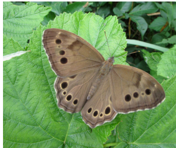
20 Northern Pearly Eye Lethe anthedon