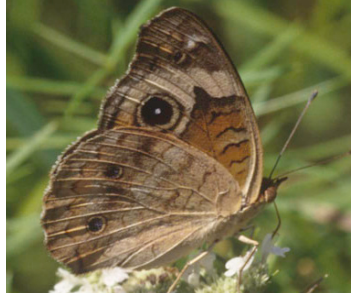
17 Common Buckeye Junonia coenia