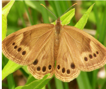
23 Eyed Brown Lethe eurydice