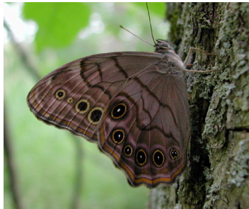
19 Northern Pearly Eye Lethe anthedon

NORTHERN PEARLY-EYE: no large eyespots. Eyespots on the underside edge of the wing surrounded by yellow. Tends to be more strongly patterned on underside. Somewhat scalloped hindwing. Savanna species. Host Plants: grasses (Poaceae).