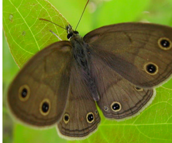
26 Little Wood Satyr Megisto cymela