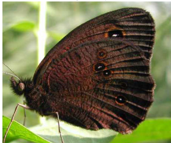
29 Common Wood Nymph Cercyonis pegala