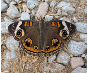
16 Common Buckeye Junonia coenia

COMMON BUCKEYE: prominent eye-spots along the margins of both wings, two orange bars on the upper forewing. Host Plants: False Foxgloves ( Agalinis ), Toadflax ( Linnaria ), and Plantain ( Plantago ).