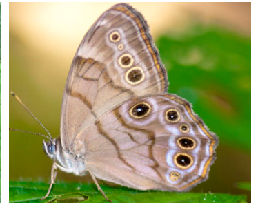
21 Northern Pearly Eye Lethe anthedon

EYED BROWN: no large eye spots. Eyespots on the underside edge of the wing surrounded by yellow and then surrounded by individual rings of brown. Each spot looks like a donut. Rounded hindwing. Found in sunny open areas. Host Plants: Sedges ( Carex ).