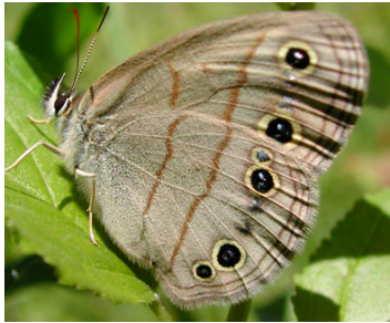
25 Little Wood Satyr Megisto cymela

LITTLE WOOD SATYR: much smaller than the above species and quite variable. Eye spots on all wings. Found in woodlands. Host Plants: Grasses (Poaceae).