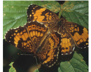
57 Silvery Checkerspot Chlosyne nycteis

MOURNING CLOAK: large butterfly with light band at edge. The only similar insect is a grasshopper. Host Plants: Willows ( Salix ) and other trees and shrubs.