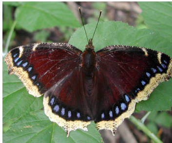
58 Mourning Cloak Nymphalis antiopa

MOURNING CLOAK: large butterfly with light band at edge. The only similar insect is a grasshopper. Host Plants: Willows ( Salix ) and other trees and shrubs.