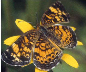
53 Pearl Crescent Phyciodes tharos