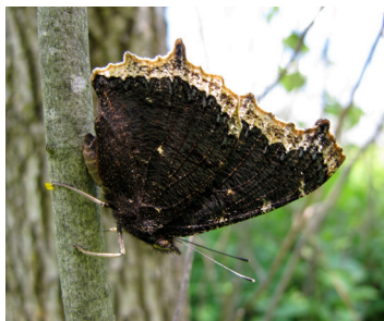
59 Mourning Cloak Nymphalis antiopa