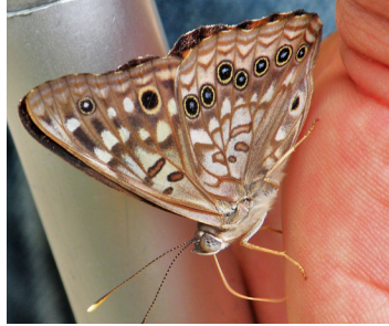
47 Hackberry Asterocampa celtis