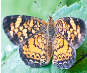
52 Pearl Crescent Phyciodes tharos

PEARL CRESCENT: long forewings. "Curly" patterns near body, black edging on top. Row of solid, black dots along hindwing margin. Fairly plain underneath. Host Plants: Asters ( Aster ).