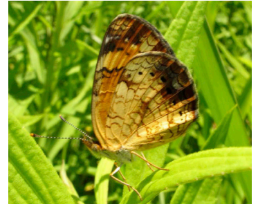
54 Pearl Crescent Phyciodes tharos

SILVERY CHECKERSPOT: Uncommon butterfly that is very similar to Pearl Crescent. Black dots on hindwing are actually donuts (with a light center). Larger than Pearl Crescent. Host Plants: Sunflowers (Asteraceae).