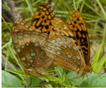
49 Great Spangled Fritillary Speyeria cybele

GREAT SPANGLED FRITILLARY: large, very fast butterfly. Underside with a light band between rows of silver spots. Several species of Fritillary are found in the area. Host Plant: Violets ( Viola ).