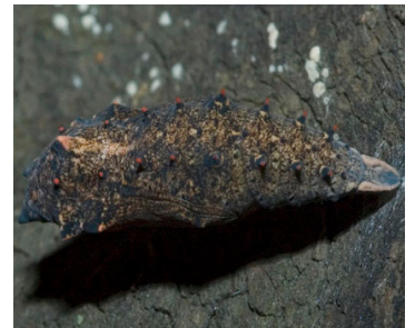
60 Mourning Cloak chrysalis Nymphalis antiopa