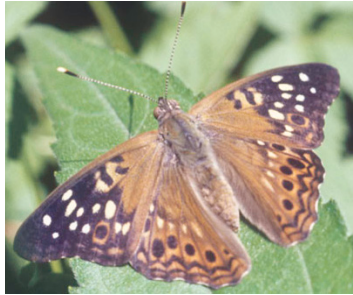
46 Hackberry Asterocampa celtis

HACKBERRY: single eyespot on the forewing and series of small eyespots on the hindwing. Host Plant: Hackberry ( Celtis ).