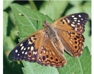
48 Hackberry Asterocampa celtis

GREAT SPANGLED FRITILLARY: large, very fast butterfly. Underside with a light band between rows of silver spots. Several species of Fritillary are found in the area. Host Plant: Violets ( Viola ).