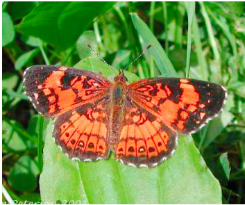
55 Silvery Checkerspot Chlosyne nycteis

SILVERY CHECKERSPOT: Uncommon butterfly that is very similar to Pearl Crescent. Black dots on hindwing are actually donuts (with a light center). Larger than Pearl Crescent. Host Plants: Sunflowers (Asteraceae).