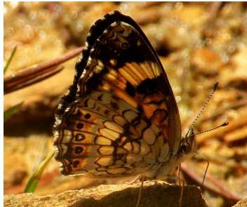
56 Silvery Checkerspot Chlosyne nycteis