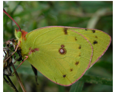
66 Orange Sulphur Colias eurytheme

SPRING AZURE: strong flyer, blue top usually seen in flight. Underside patterned like hairstreaks or eastern tailed blue. No colored spots on underside. No tails. Host Plants: various.