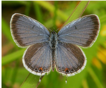
71 Eastern Tailed Blue Cupido comyntas