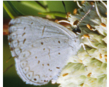
69 Summer Spring Azure Celastrina neglecta

EASTERN TAILED BLUE: weak flyer, blue or very dark top. Usually stays right above the vegetation. Orange spots on the underside. Tails on hindwing. Host Plants: Pea family (Fabaceae).