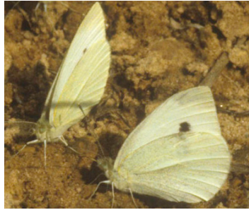
62 Cabbage White Pieris rapae