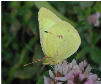
64 Clouded Sulphur Colias philodice

CLOUDED AND ORANGE SULPHURS: yellow to orange-yellow with black along the upperside edges. These species will hybridize. Females can be white. Clouded sulphur upperside without orange patches. Orange sulphur has at least some orange hue above. Host Plants: Clovers and Alfalfa (Fabaceae).