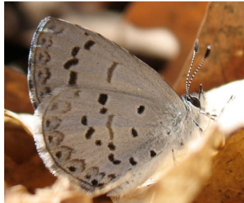
68 Spring Azure Celastrina ladon