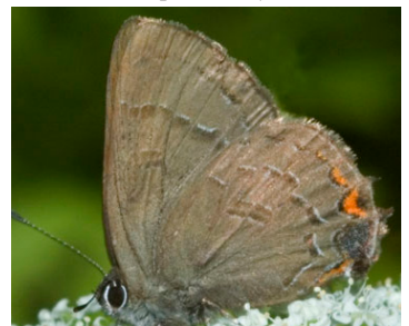
75 Banded Hairstreak Satyrium calanus