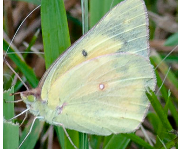
65 Orange Sulphur Colias eurytheme