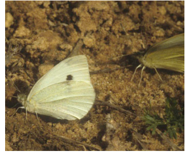
63 Cabbage White Pieris rapae

CLOUDED AND ORANGE SULPHURS: yellow to orange-yellow with black along the upperside edges. These species will hybridize. Females can be white. Clouded sulphur upperside without orange patches. Orange sulphur has at least some orange hue above. Host Plants: Clovers and Alfalfa (Fabaceae).