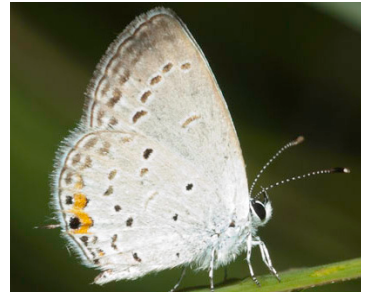
72 Eastern Tailed Blue Cupido comyntas

ACADIAN AND BANDED HAIRSTREAKS: no dots near the body on the hairstreaks as seen in the previous two species. Blue and orange dots on the underside. Banded Hairstreak with a band of dashes on the underside. Host Plants: Acadian: Willows ( Salix ); Banded: Oaks ( Quercus ) and Hickories ( Carya ).