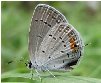
70 Eastern Tailed Blue Cupido comyntas

EASTERN TAILED BLUE: weak flyer, blue or very dark top. Usually stays right above the vegetation. Orange spots on the underside. Tails on hindwing. Host Plants: Pea family (Fabaceae).