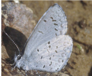
67 Spring Azure Celastrina ladon

SPRING AZURE: strong flyer, blue top usually seen in flight. Underside patterned like hairstreaks or eastern tailed blue. No colored spots on underside. No tails. Host Plants: various.