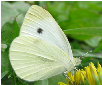
61 Cabbage White Pieris rapae

CABBAGE WHITE: very common, white butterfly with one black spot. Host Plants: various.