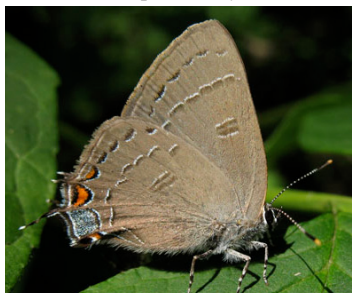
74 Banded Hairstreak Satyrium calanus